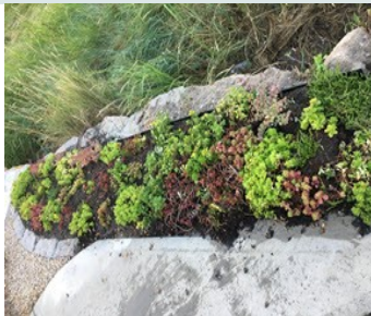
Sedums at the footwash station at Good Harbor Beach