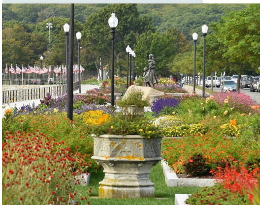
Stacy Boulevard in bloom.