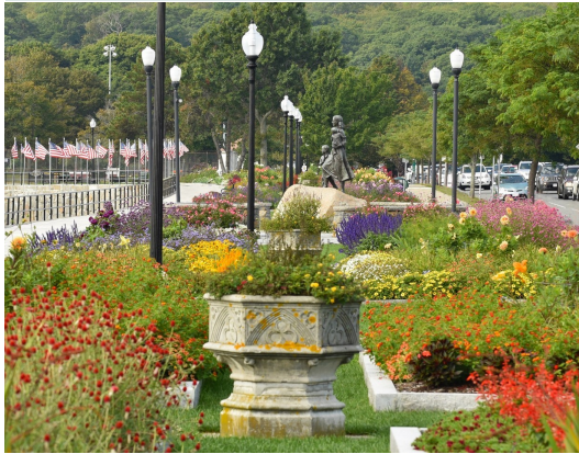
Stacy Boulevard in bloom.

Although the Stacy Boulevard Gardens are our flagship, we care for over 45 other spaces in Gloucester. Please see our website for more information and a map of locations at GenerousGardeners.org